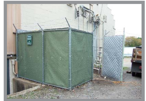
Panels were made for two of the walls of this enclosure, with a separate panel for the door.